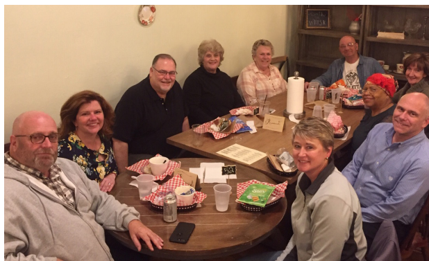
Our Spring Dinners for 8 group met at Whisk & Barrel for their first meal. Fall sign-ups will be announced this Summer.

10:30 a.m. Traditional Worship in the Sanctuary