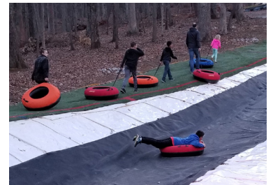
Photos from our Youth trip tubing at Crowder's Ridge.